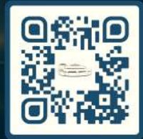
Scan QR Code for directions

SUNDAY 10AM | 24456 Immink Drive, Zone 6, Diepkloof, SOWETO