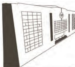
Park Station: 25 Plein Street, Johannesburg

Orange Farm 1: Orange Farm 1: Falcon Road, EXT 6A, (Near Spar) Protea Glen: 3806 Igwayigwayi Street, Extension 4 Rabie Ridge: 706 Rietduiker Street (Opp. BP Garage) Randburg 1: 4 Dover & Bram Fischer, (Opp. Garden Mall) Randfontein: Roma Building, 17 Sixth Street (Opp. Midas) Roodepoort: 37 Mooi Street Sebokeng: 392 Moshoeshoe Street, Zone 10 (Formerly Freddie's supermarket) Springs: First Floor, Erf 977, Geduld, Springs Spruitview: 23 Cnr Brickfield & Moagi Road Thembisa 1: 87 Kestrel Street, Mathole, Difaeng Thokoza 1: 1838 Rakoma Street (Opp Shell Garage) Vanderbijlpark: Shop No. 4, C R Swart Street (Next to OK Furniture) Vereeniging: Shop 1, 8 Kruger Avenue (Opp Sassa) Vosloorus: 8384 Heidelberg Road, Cnr Mottile Street (Next to Ratanda Multipurpose Hall) Pretoria: 175 Nana Sita Street (old Skinner Street), Pretoria Central Mabopane: 2733 Block B (Next to Tlamelong Clinic) Mamelodi: No 1 Dabolwane street, Cnr Tsamaya Road, Mamelodi West (Next to Denneboom station) Hammanskraal: 4411 Unit 01 Temba, Kudube